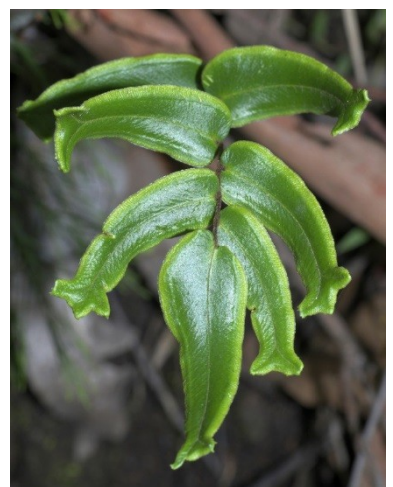
Unusual form of Pellaea paradoxa, photographed on the circuit track at Queen Mary Falls.