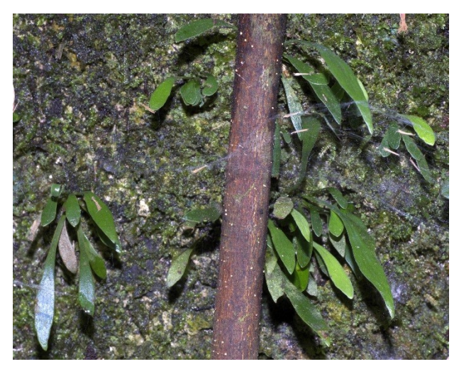
Another small patch of Antrophyum austroqueenslandicum from the Tweed site. The largest fronds are only a few cm long.