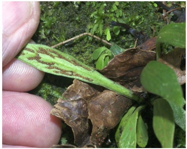
Antrophyum austroqueenslandicum photographed in situ in northern New South Wales. Note the tiny immature plants above the dead leaf.